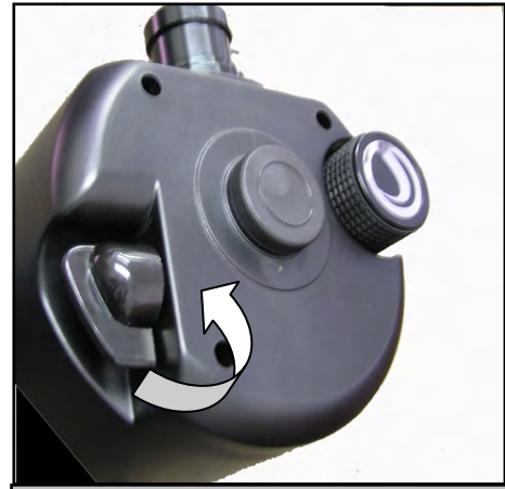
Figure 1-2 – Flip mirror shown in the "down" position for viewing from the top of the rear cell.

The C90 Mak spotting scope focusing mechanism controls the position of the primary mirror which slides back and forth on the primary baffle tube. Turn the focusing knob until the image is sharp. If the knob will not turn, the primary mirror has reached the end of its travel on the focusing mechanism. Turn the knob in the opposite direction until the image is sharp. Once an image is in focus, turn the knob clockwise to focus on a closer object and counterclockwise for a more distant object. A single turn of the focusing knob moves the primary mirror only slightly. Therefore, it will take many turns to go from close focus (approximately 20 feet) to infinity. For astronomical