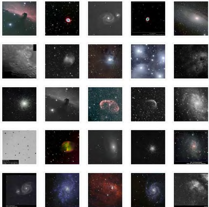
A selection of competition images from our website

Entries in jpeg format to Competition@atik-cameras.com please, with details of camera type, telescope, object and your name. For further details please see the competition webpage at http://www.atik-cameras.com/competition .