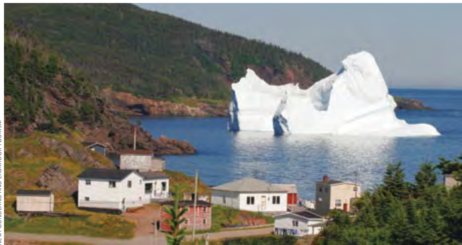
NEWFOUNDLAND AND LABRADOR TOURISM

COLLISION COURSE This map shows the known route of the Titanic and a possible path for the iceberg. We will never know the iceberg’s actual trajectory, but modern knowledge of currents and drift patterns make this a highly plausible scenario. Had it not been for the enhanced tidal effects a few months earlier, the iceberg might have run aground on the Labrador or Newfoundland coast, and remained permanently stuck until it melted.